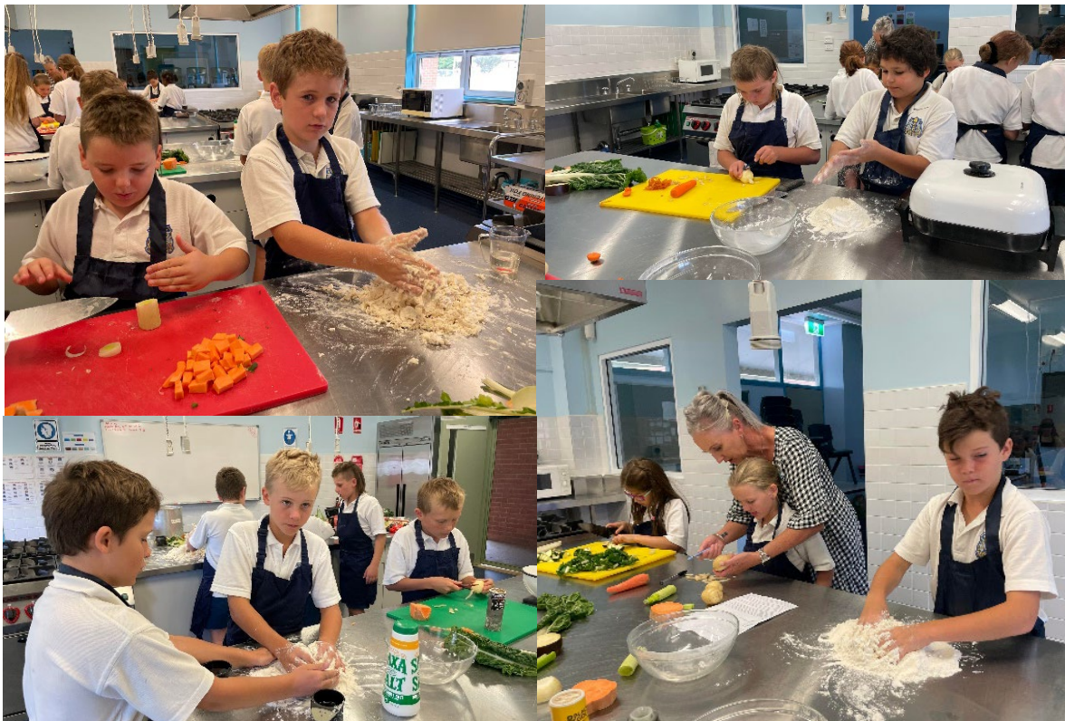
Year 5/6 Celebrated Pi Day by cooking vegetable pies.

Pi Day is on March 14, and any day that combines fun, education, and pie is a day worth celebrating! Pi, also known by the Greek letter “ \pi ,” is a constant value used in math that represents the ratio of a circumference of a circle to its diameter, which is just about 3.14....15...9265359... (and so on). Not only that, but the fourteenth of March is also Albert Einstein’s birthday, so altogether it’s nothing short of a mathematician’s delight.