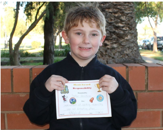
Kinder – Saxton & Oliver (absent)