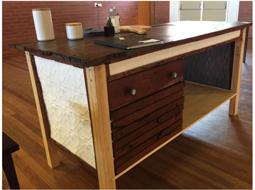
Sophie's outdoor entertainment unit with Redgum and pressed metal