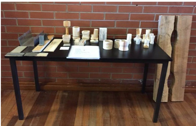
Javen's wooden tumblers and shot glasses made from discarded timber.