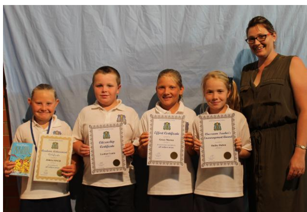
Year 3 Class Merit Awards