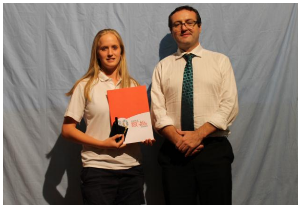
Caltex Best All Rounder Award