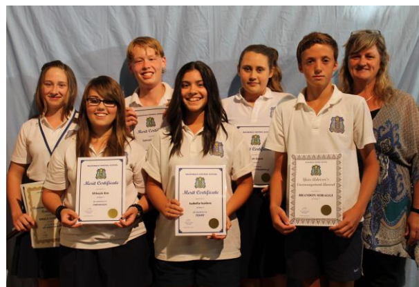
Year 7 Class Merit Awards