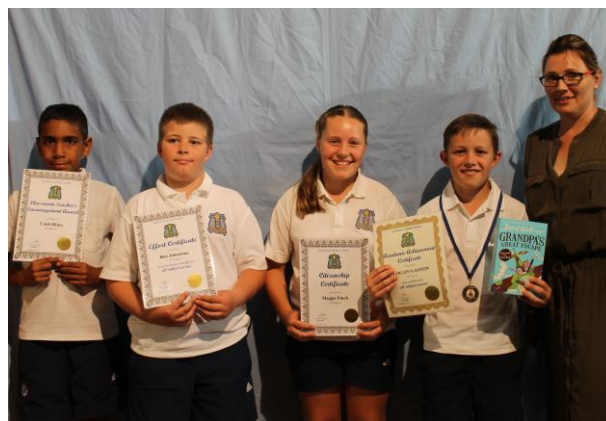
Year 4 Class Merit Awards