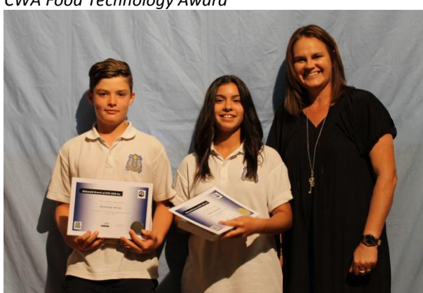
Balranald ICPA NSW Inc. Commitment to Education Awards