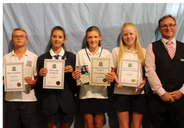
Year 6 Class Merit Awards