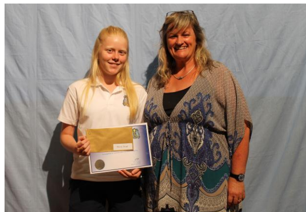
Balaranald/Tooleybuc Teachers Federation Award