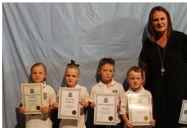
Kindergarten Class Merit Awards