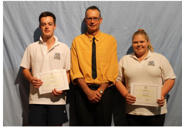
Balranald & District Ex-servicemen's Memorial Club 2016 Scholarships