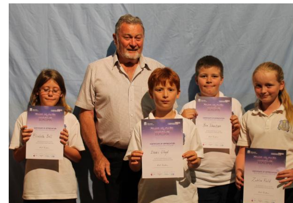
School Spectacular Certificates