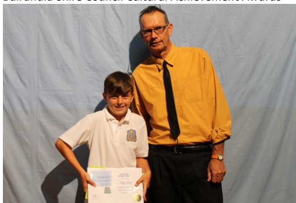
Masonic Lodge Primary Citizenship Award