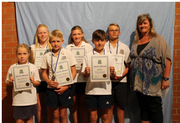
Primary Swimming Champions