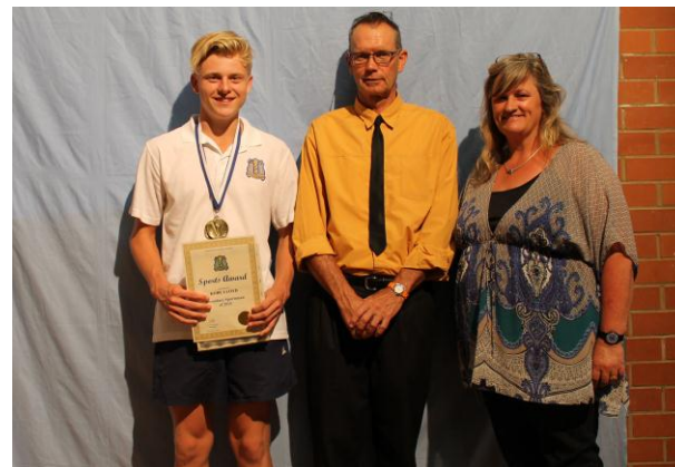
Secondary Outstanding Sporting Achievement