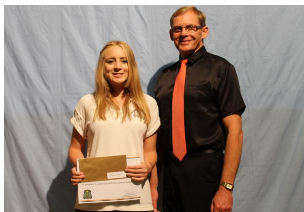
Employment Works Academic Effort & Achievement