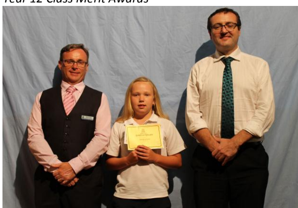
Balranald Central School Gold Award