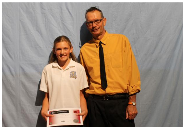
Balranald & District Ex-Servicemen's Memorial Club Award