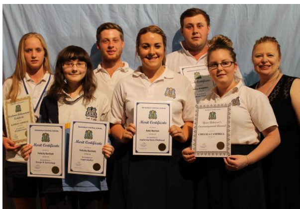
Year 12 Class Merit Awards