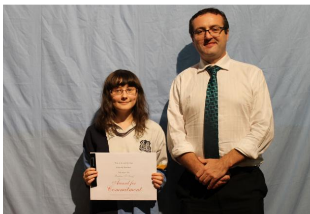
Reuben F Scarf Effort Award