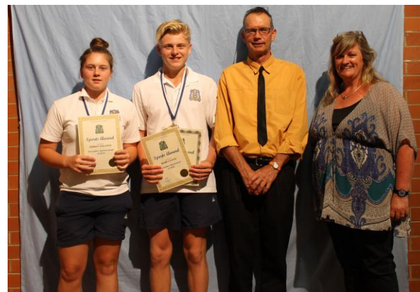
Secondary Sportswoman and Sportsman Achievement