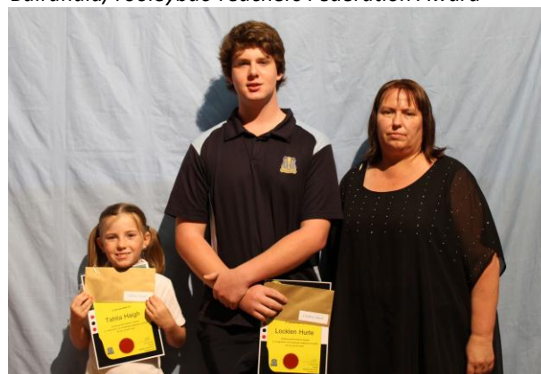
Primary & Secondary Balaranald Senior Citizens Awards