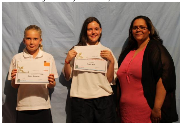
Yarkuwa Indigenous Knowledge Centre Award