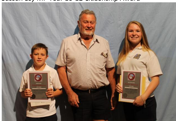
Balaranald Shire Council Cultural Achievement Awards