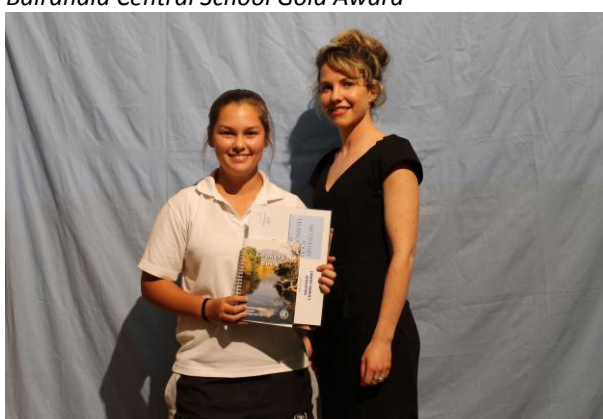
CWA Food Technology Award