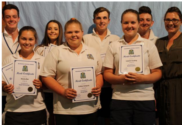
Year 10 Class Merit Awards