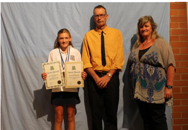
Primary Outstanding Sporting Achievement