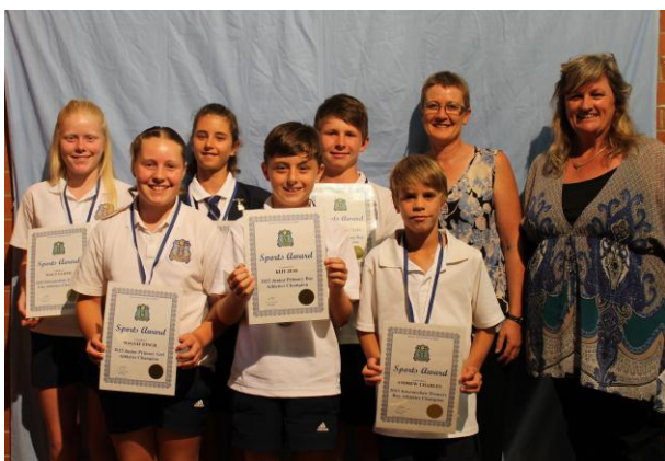
Primary Athletics Champions