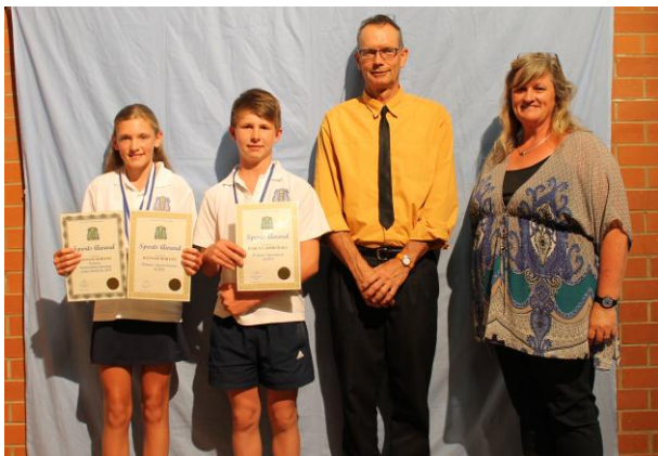
Primary Sportswoman and Sportsman Achievement