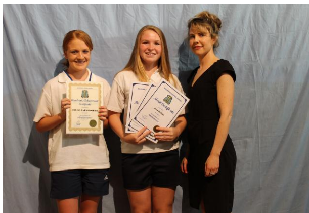
Year 8 Class Merit Awards