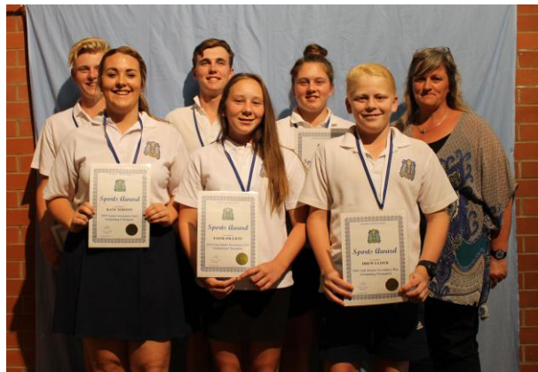
Secondary Swimming Champions