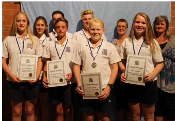
Secondary Athletics Champions