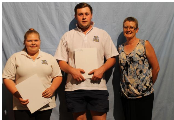
Australian Defence Force Leadership & Teamwork Awards