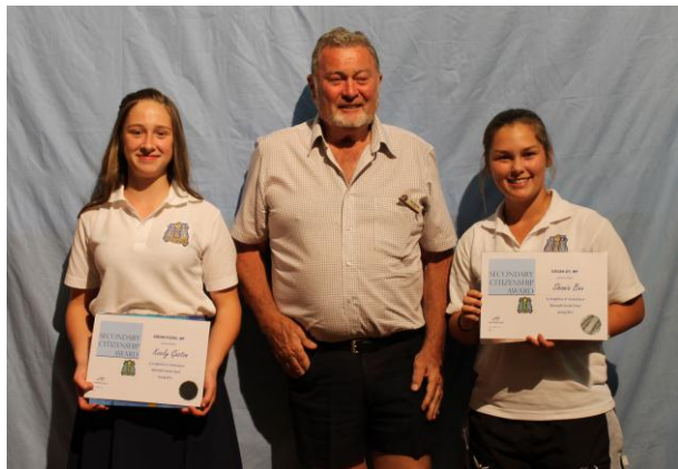
Adrian Piccoli MP Year 7-9 Citizenship Award Sussan Ley MP Year 10-12 Citizenship Award