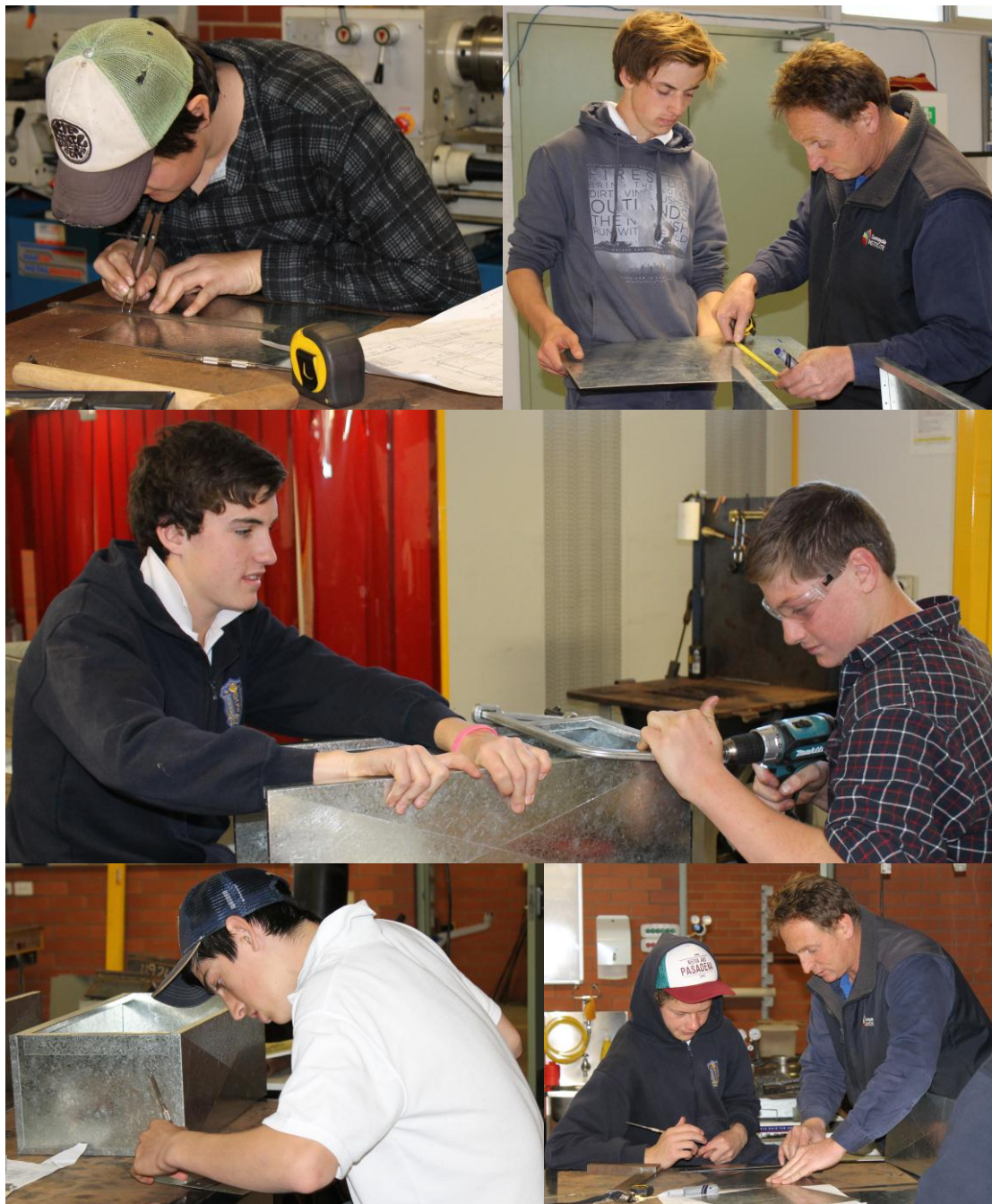
Pictured: Year 10 students working on their Maths in Trades projects

Please note that there will be no Homework Club this week.