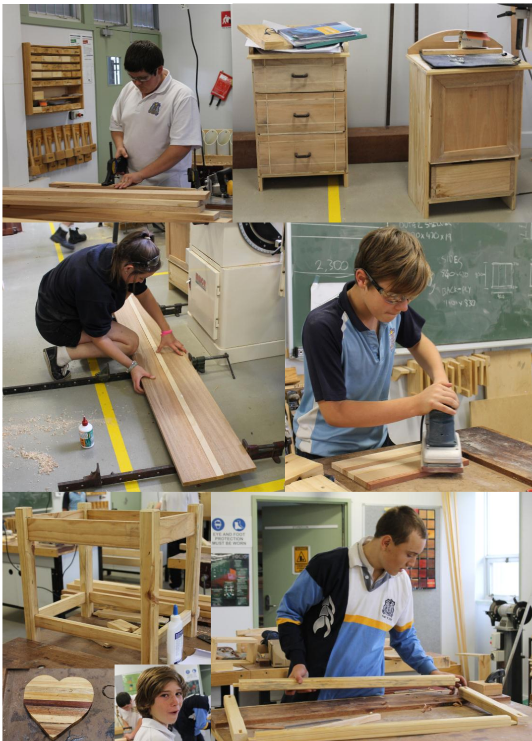
Pictured: Students working on their various timber projects.