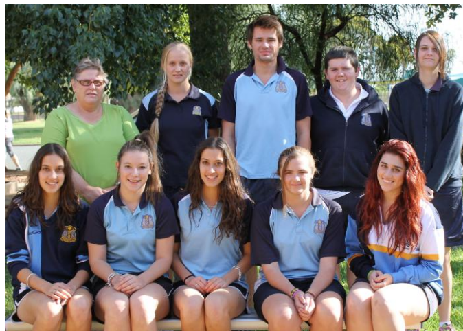
Pictured: The Stage 6 Hospitality group

A big thank you also to Cafè Cassaro for their kind donation to the Hospitality group of a bag of organic, fair trade coffee beans.