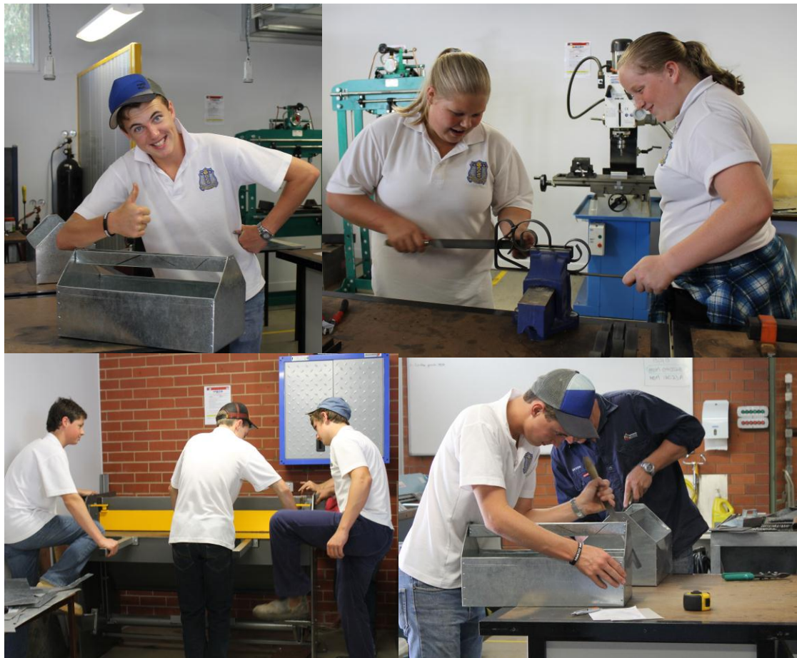
Pictured: Year 9 students working on their Maths in Trades projects.