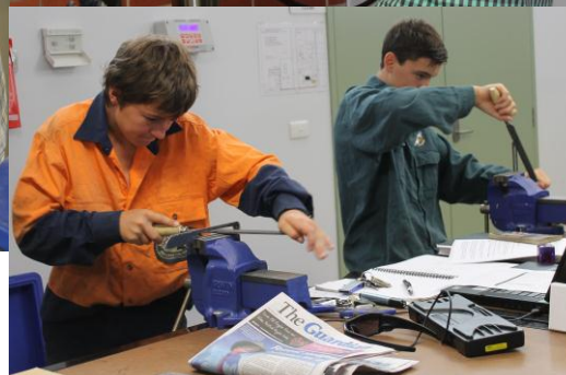
Pictured: Year 9 students participating in the Maths in Trades Program.